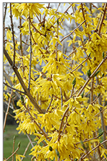
Northern Gold Forsythia flowers