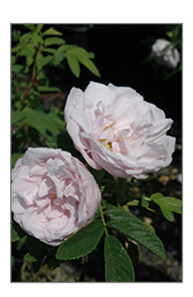
Snow Pavement Rose flowers