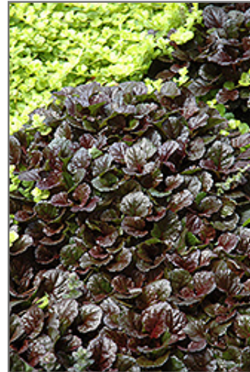
Black Scallop Bugleweed