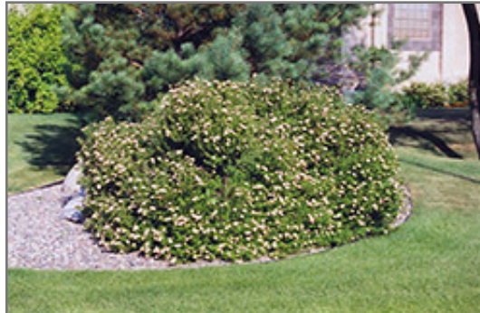
Pink Beauty Potentilla in bloom