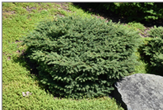
Birds Nest Spruce