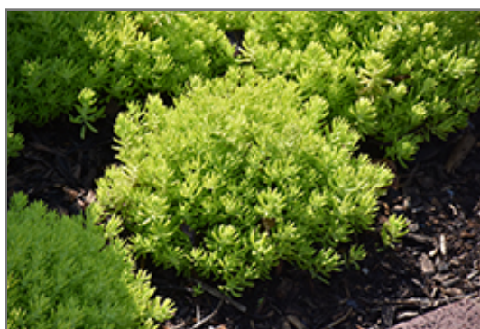
Lemon Coral Stonecrop