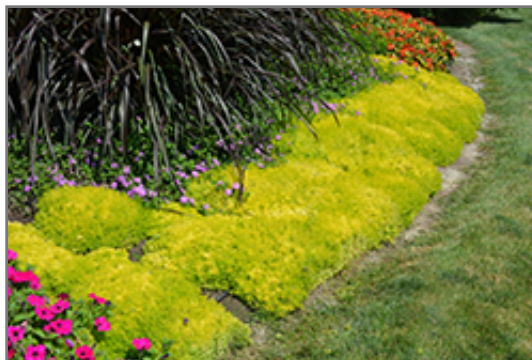
Lemon Coral Stonecrop

This plant is not reliably hardy in our region, and certain restrictions may apply; contact the store for more information.